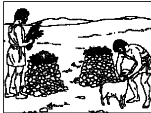
CHRONOLOGICAL PICTURE NO. 8, "CAIN AND ABEL BRING OFFERINGS TO GOD"

God rejected Cain and his offering because: